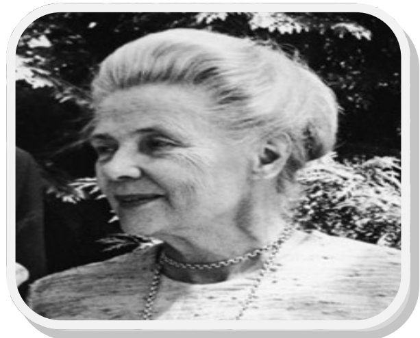
Alva Myrdal [Nobel Peace Laureate 1982]